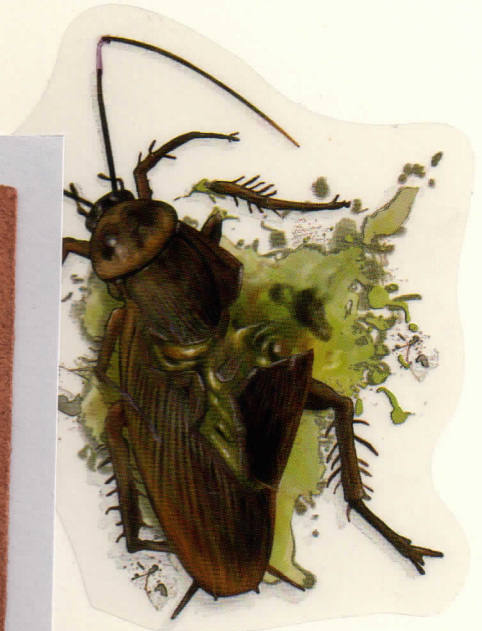
This one didn't get away!

There are two small spikes at the rear. These feelers are attuned to vibrations or movements in the air. They detect air currents. When you raise your foot to kill the cockroach it has already sensed your presence and has run for cover to the nearest hiding place.