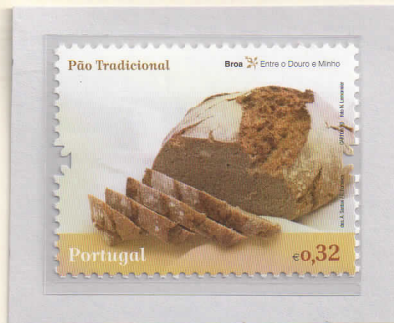
Perforation 12x11¾ Syncopated